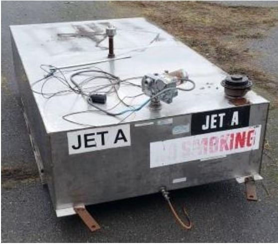
Stainless Steel Jet A Fuel Tank 84"x 48"x 18" Approx. 250Gal. $1000.00