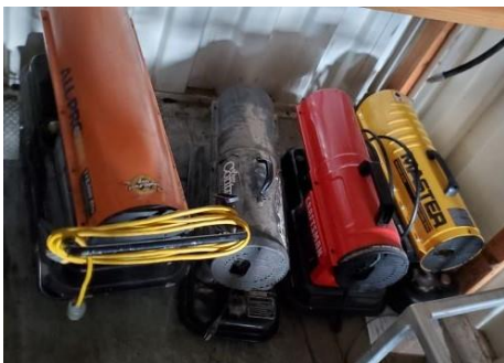
Kerosene Bullet heaters $50 ea.