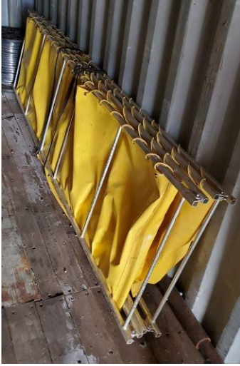
Collapsible Tank 10'x10'x30"