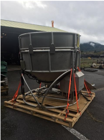
Isolair Aerial Seeding Bucket 80 cubic yards + 20 cubic yard extension. Gasoline powered. $19,000