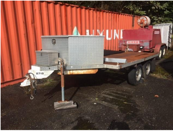
8715- Short Flatbed trailer. $1500