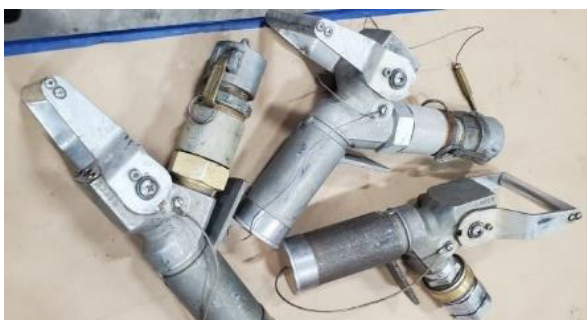
Carter CCR Fueling Nozzles $350 ea.