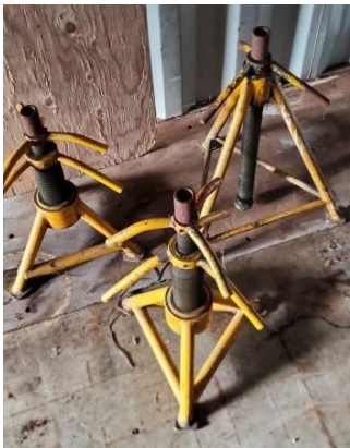
Aircraft Jacks $150 Lot