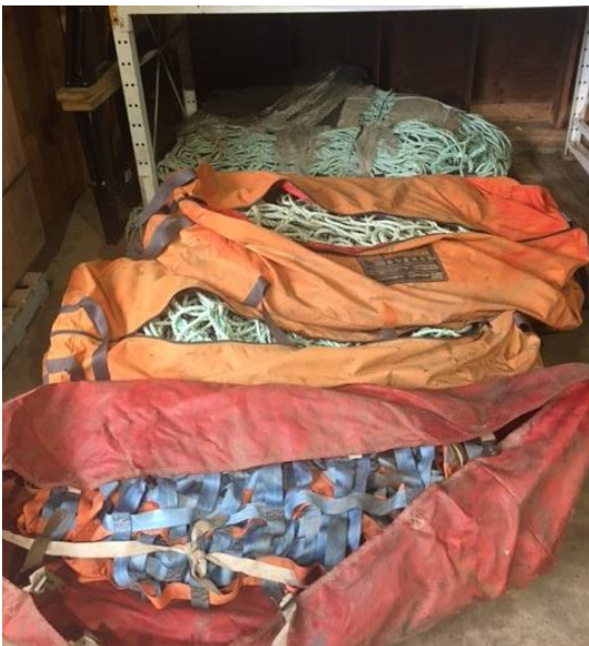
Lot of (5) Cargo Nets. Onboard Systems. Roughly 12' x 12', 8" Squares. $650