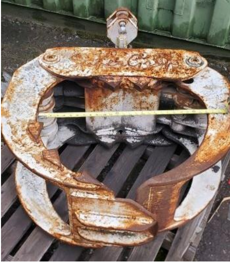
3ea. Sure Grip Hydraulic Grapple Make Offer