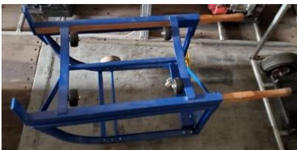
55 Gal Drum Dolly $150