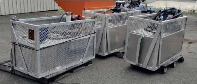
Portable Fuel Tanks