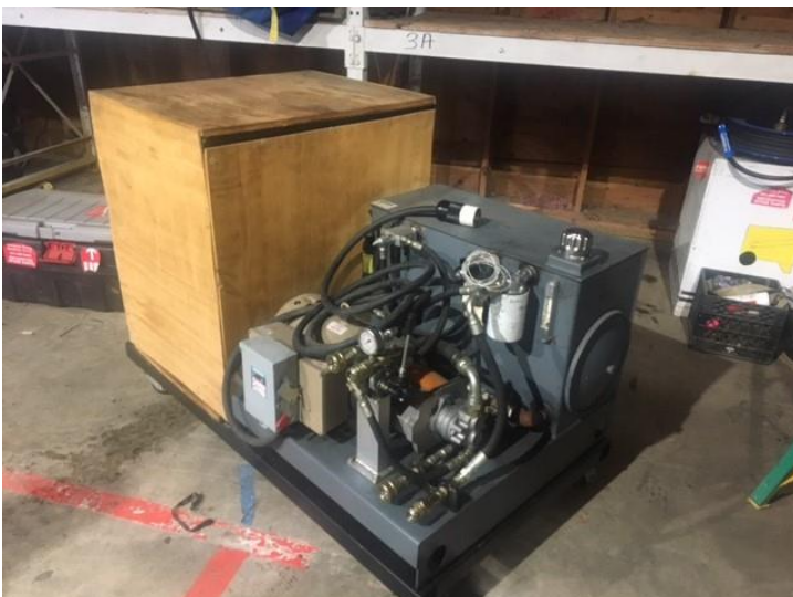
Hydraulic Mule – 3,000 psi, self contained on mobile platform Make Offer